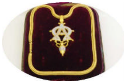
Etruscan Revival Pendant Added to Archives Collection

Now that we know where it came from, we're hoping to find out who might have been the last SGA president to wear the necklace!