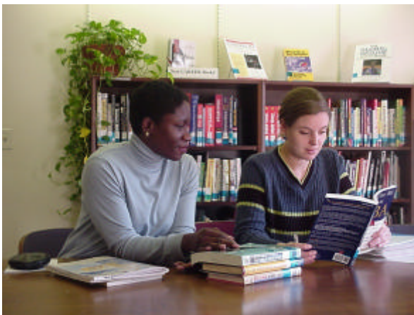
GSM Students Working in the Pat Miller Career Room

The book collection covers a range of career topics such as insider information on business careers, insights on industries, dozens of sample resume books, an excellent collection of interviewing guides, self assessment and career exploration books, resources on work/life balance and much more. Some of the GSML's most popular career books include: Is That Your Best Offer: How to Negotiate a Higher Salary and More Perk ; HBS's Career Guide to Management Consulting ; Vault Reports Guide to the Top Investment