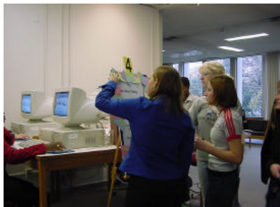
Students learn about the libraries' online catalog and choose a topic to search.

Two sections of MCC played simultaneously,