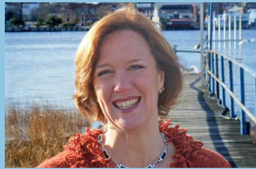
Anne Rundle School of Health Studies