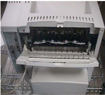
Left access door (fuser assembly)