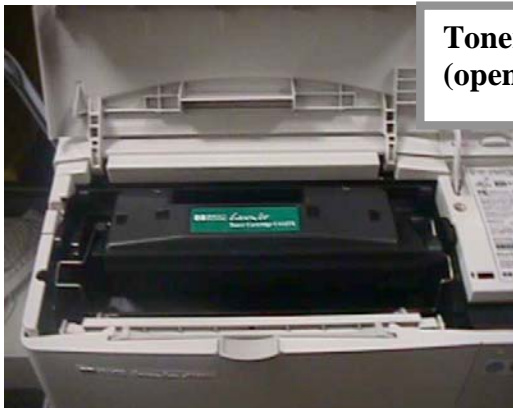
Toner access door (open & close to reset printer)